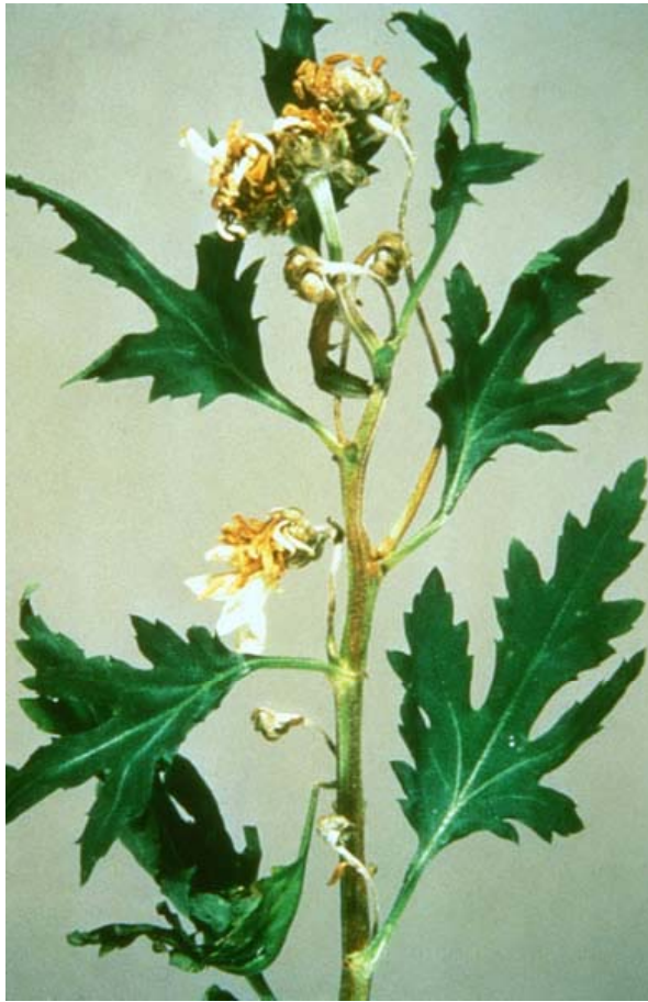
Fig 2. Impatiens infected by INSV.